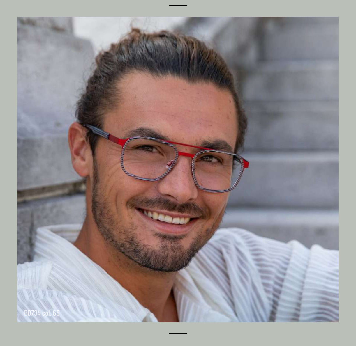
Our models are made of high-quality and lightweight materials, which ensures comfortable and long wearing pleasure.